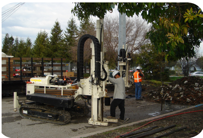
Injection of vegetable oil underground to improve conditions for bioremediation.

Bioremediation has successfully cleaned up many polluted sites and has been selected or is being used at over 100 Superfund sites across the country.