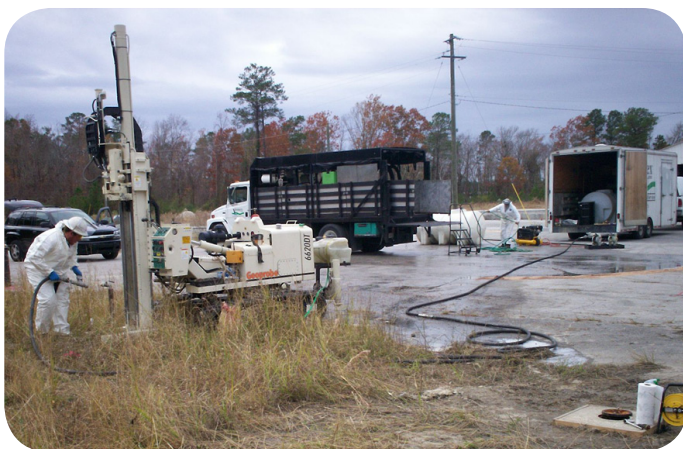
Injection of reducing agent into a hole drilled underground.

ISCR can treat some types of contaminants including DNAPLs that are difficult to clean up using other methods. It can destroy most of the contamination in situ without having to pump groundwater for treatment or dig up soil for transport to a landfill or treatment facility. This can save time and money. In addition, no energy is needed to operate a PRB because it relies on the natural flow of groundwater. ISCR is a relatively new method for cleaning up hazardous waste sites, but is seeing increased use at Superfund sites across the country.