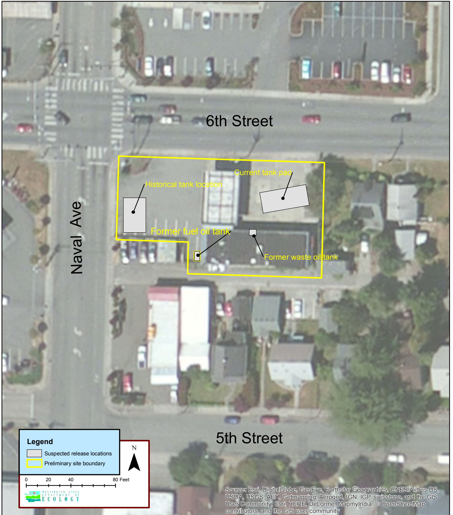
Exhibit A Newman's Chevron Site 2021 6th Street Bremerton WA 98301