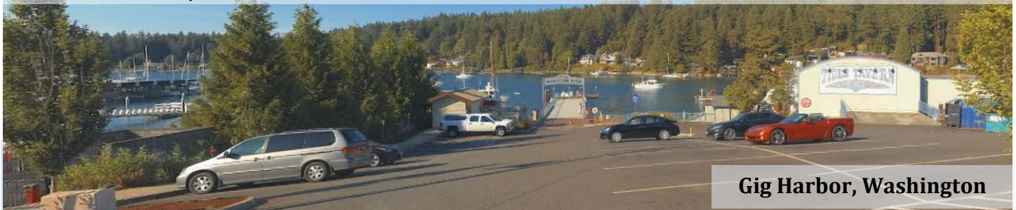
Gig Harbor, Washington