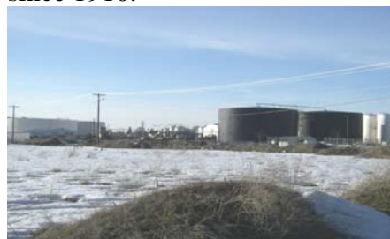
Looking North Toward the Site

SemMaterials is the current operator of the leased facility formerly known as Koch Materials. The facility receives and stores petroleum products used in the manufacture of asphalt and sealants. The site has reportedly been used for petroleum-related operations since 1910.