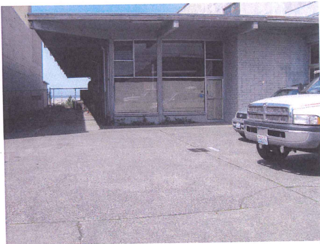
Shooting Date/Time : 5/4/2011 11:56:13 AM