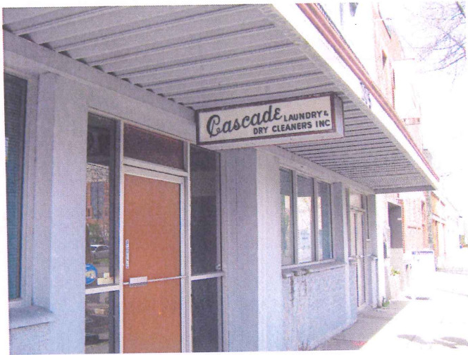
Shooting Date/Time : 5/4/2011 11:55:46 AM