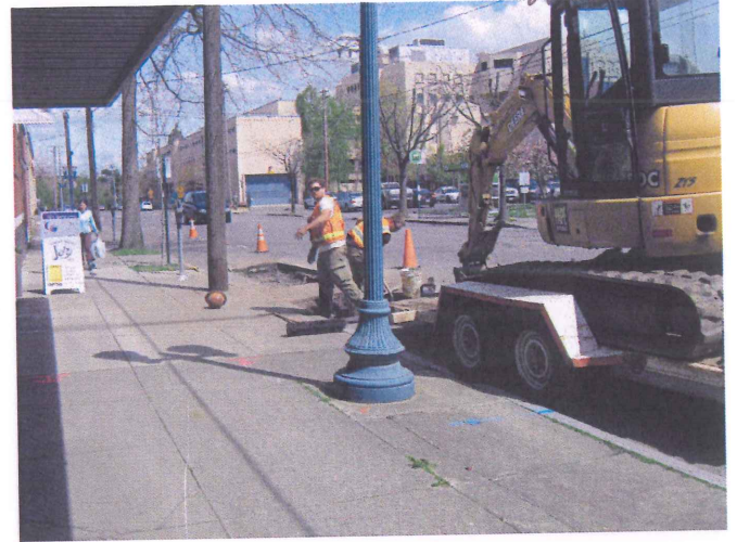
Shooting Date/Time : 5/4/2011 11:55:52 AM