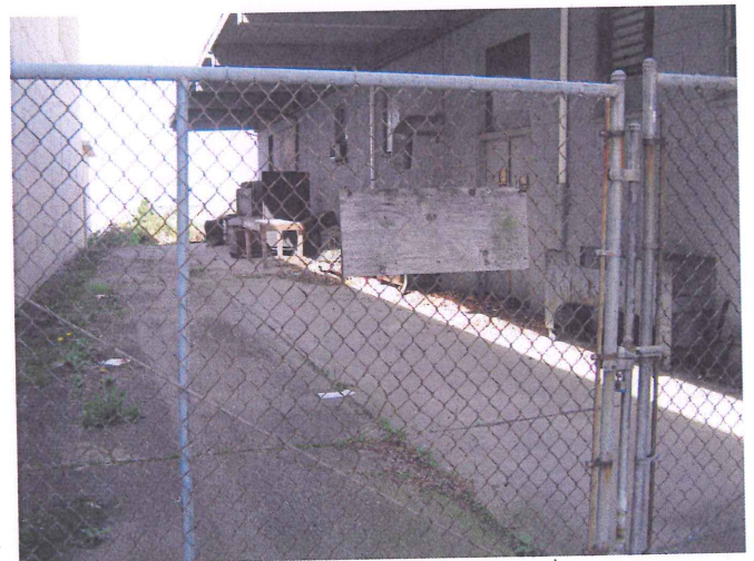
Shooting Date/Time : 5/4/2011 11:56:40 AM