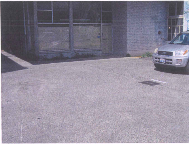
Shooting Date/Time : 5/4/2011 11:57:07 AM