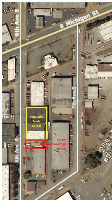
General Site location.

The UST was removed in 2000 and reportedly had never leaked. Since no samples were collected at the time of removal to confirm a clean tank closure, soil samples were collected from 3 borings (B-4, -5, -6; see figures below) in the former UST location. Groundwater was encountered in borings B-4 and B-5 at approximately 5.5 feet below ground surface (bgs), and samples were collected. Soil and groundwater were analyzed for diesel and oil range petroleum hydrocarbons. None of the samples contained petroleum hydrocarbons above laboratory reporting limits.