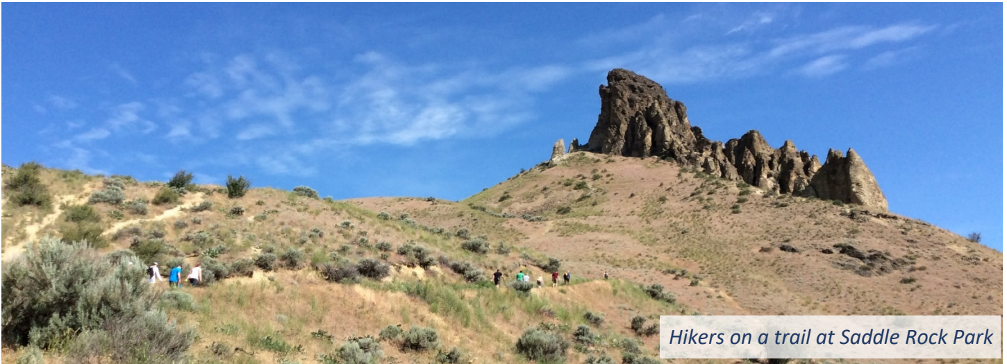
Hikers on a trail at Saddle Rock Park