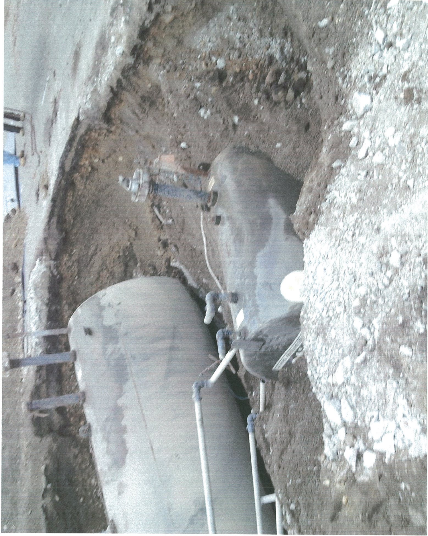
USTs IN EXCAVATION