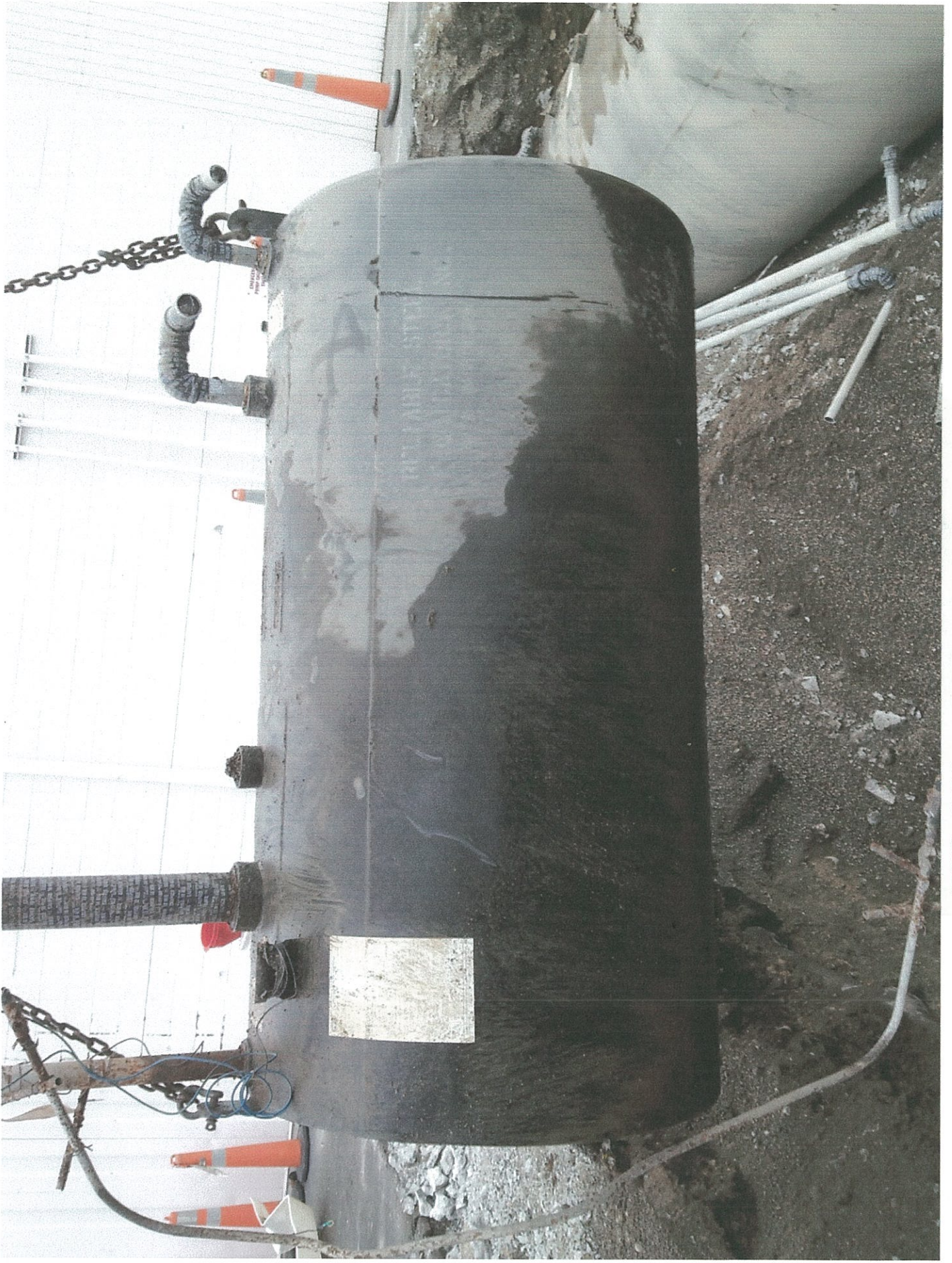
500 GAL. USED OIL UST