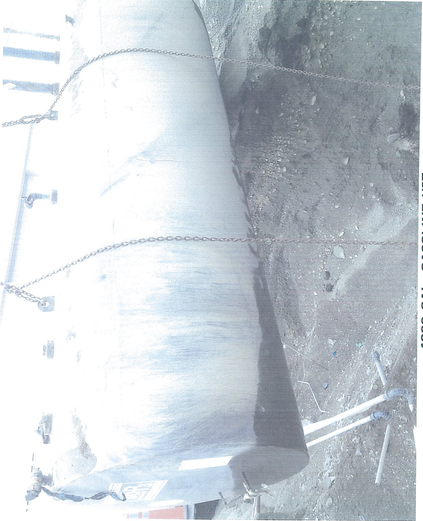
4000 GAL. GASOLINE UST