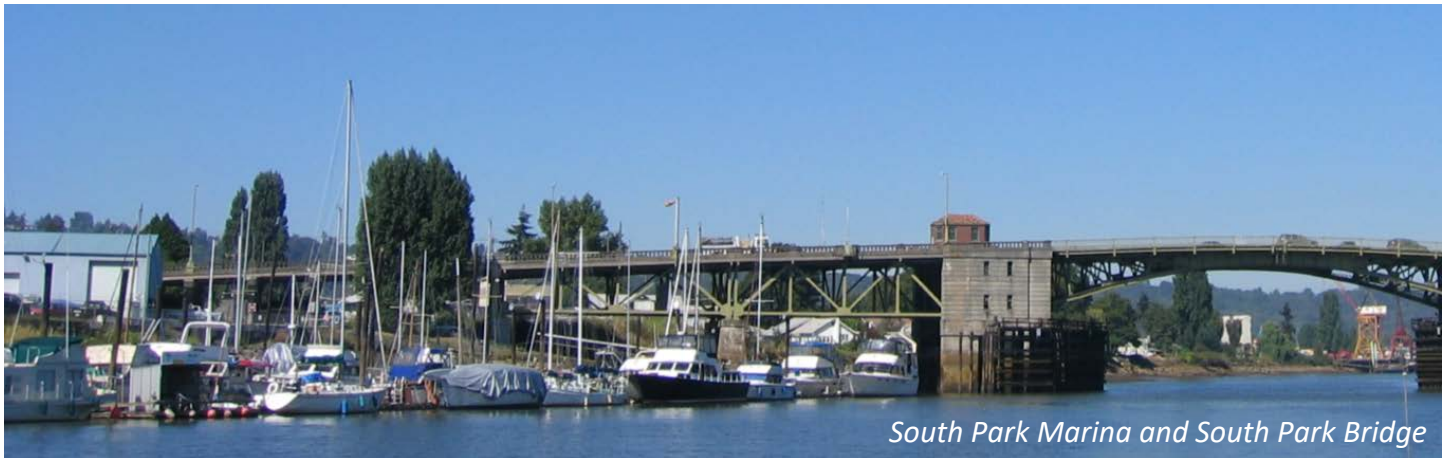
South Park Marina and South Park Bridge