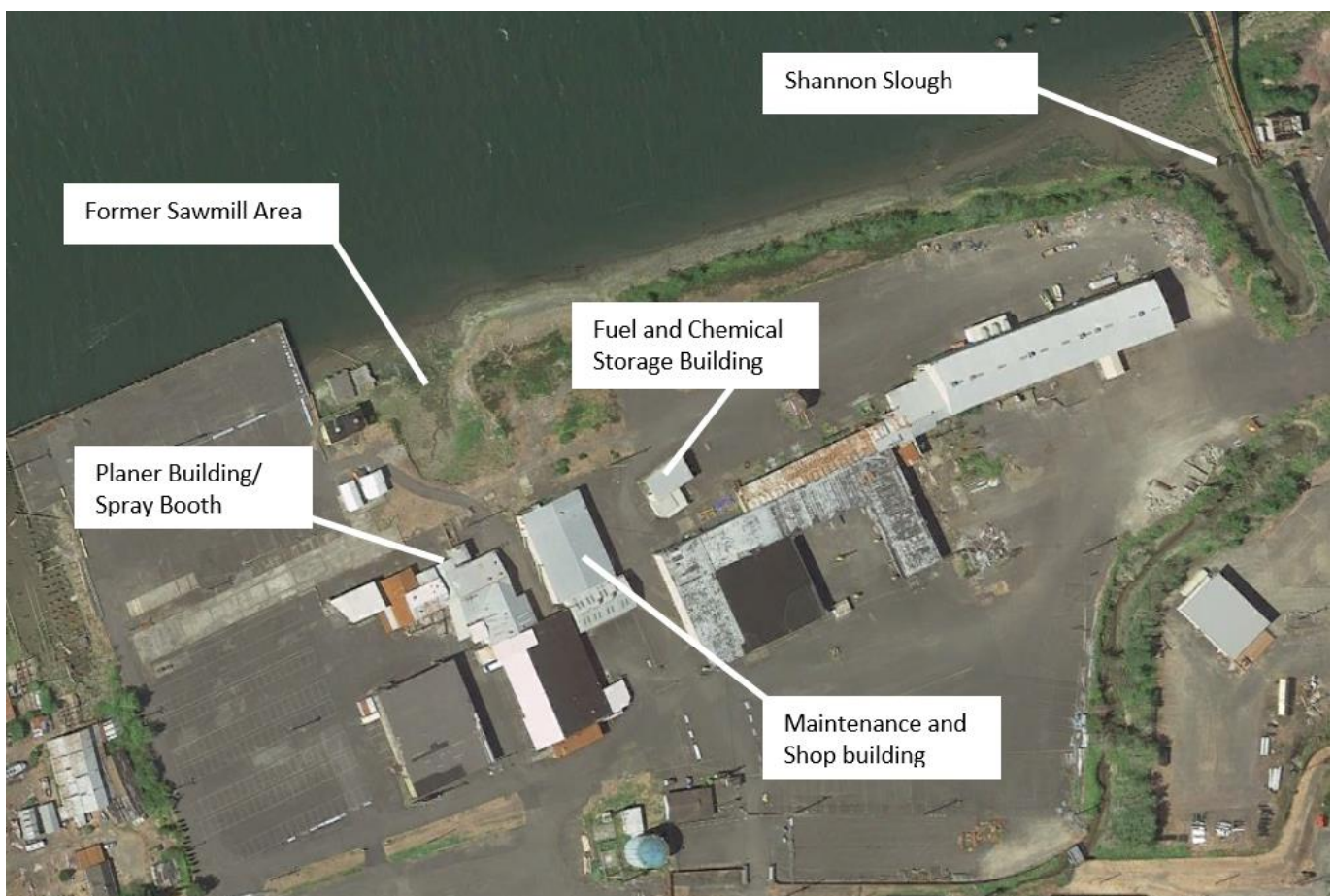
Figure 2 Possible areas of contamination and cleanup at Weyerhaeuser Sawmill Aberdeen

Ecology will consider your comments before the Agreed Order, document for the proposed removal of the environmental covenant, and Public Participation Plan are finalized. We will reply to comments in a responsiveness summary after the comment period ends.