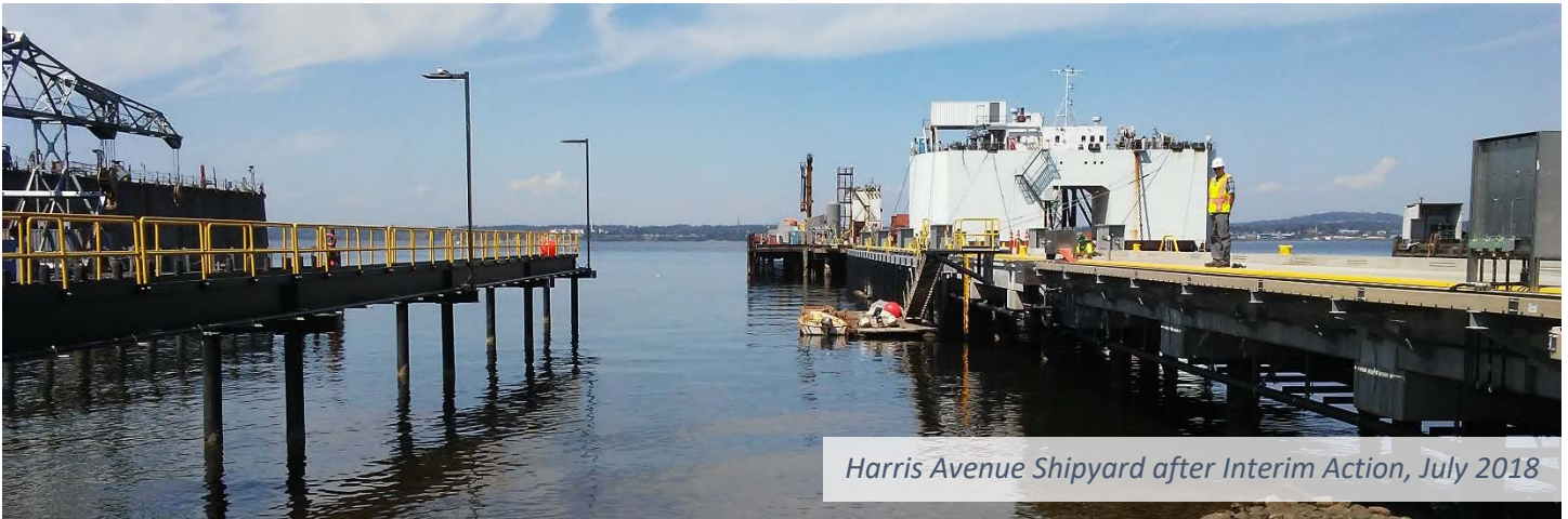
Harris Avenue Shipyard after Interim Action, July 2018