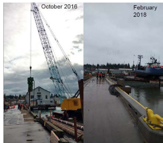
Harris Avenue Pier before/after Interim Action