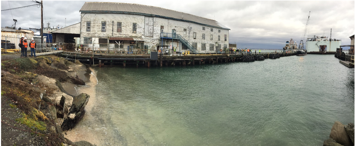
Carpenter Building and pier before Interim Action, January 2017