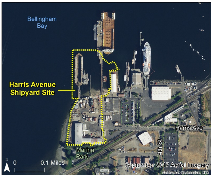
Aerial view of Harris Avenue Shipyard cleanup site