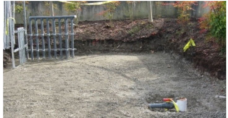
A soil vapor extraction system