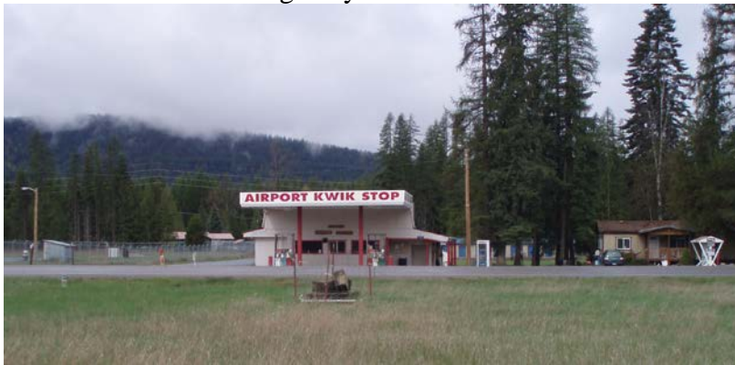
Airport Kwik Stop Site

The Department of Ecology is conducting a Remedial Investigation and Feasibility Study at the Airport Kwik Stop site located west of Highway 31 and north of Greenhouse Road in Ione, Pend Oreille County, Washington (see Fig. 1). Petroleum contamination is found in soil and groundwater at the Airport Kwik Stop, beneath the Cabin Grill, and on private properties of two other landowners. One property is located south of the Cabin Grill, and the other is north of Dewitt Road and east of Highway 31.