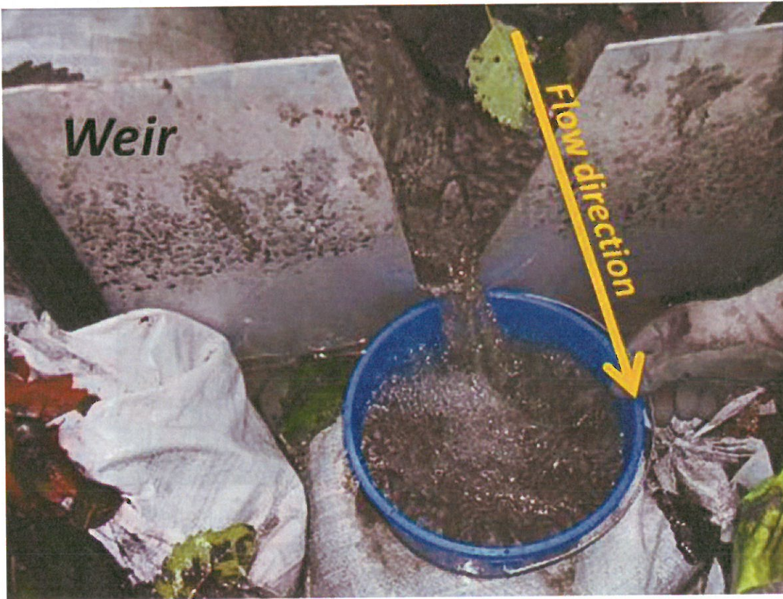
The above photo shows a catch with a lot of sediment (Sed) and splashing (S).