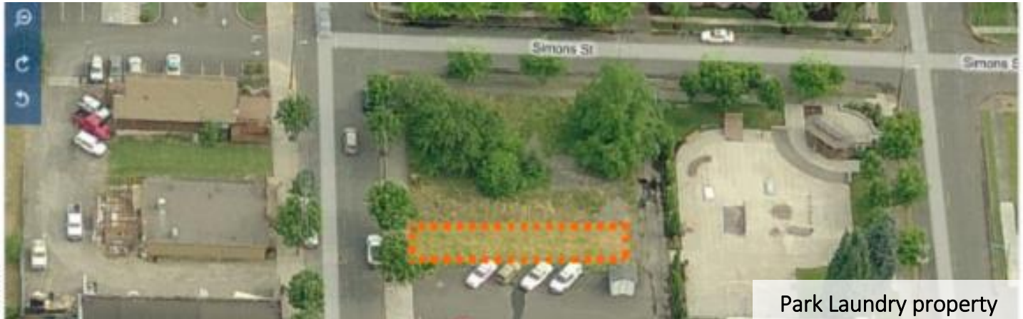
Park Laundry property