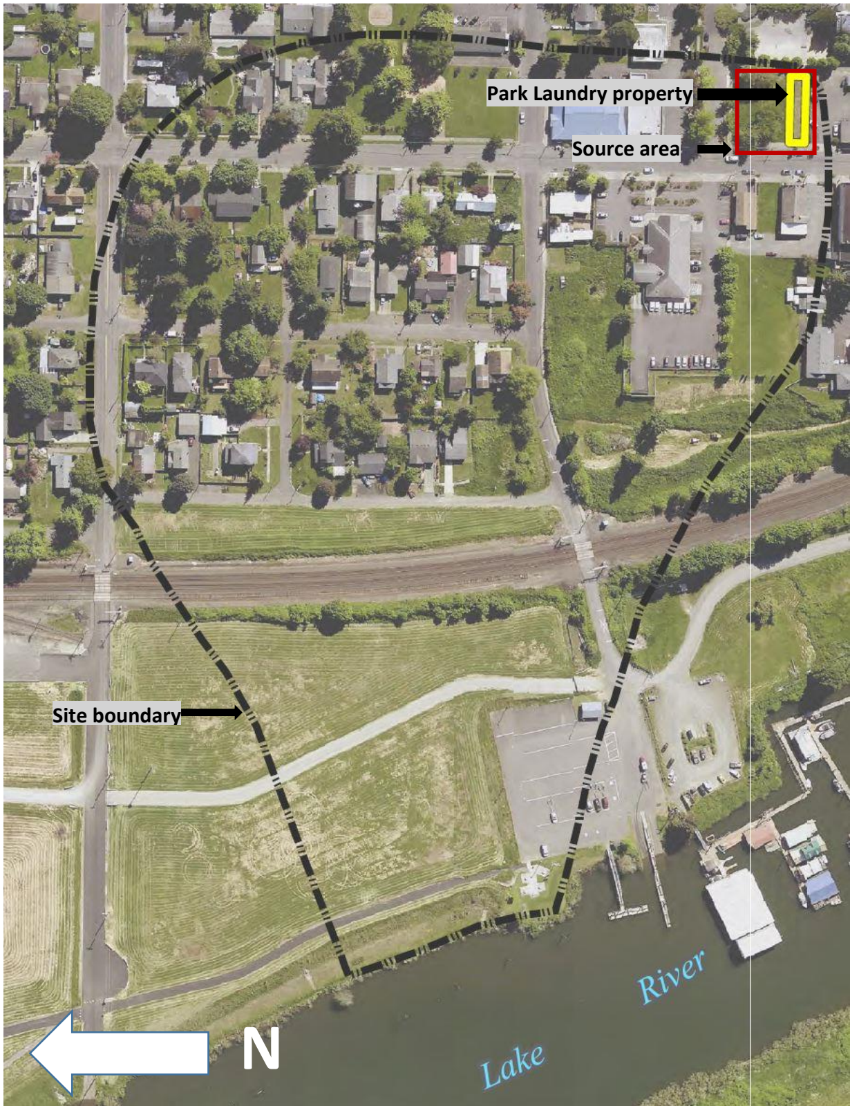
Figure 1. Park Laundry site boundary, property and source area