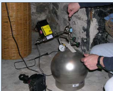
Figure 1. Sampling indoor air with a Summa canister.

To request ADA accommodation or materials in a format for the visually impaired, visit https://ecology.wa.gov/accessibility call Ecology at 360-407-7285, Relay Service 711, or TTY 877-833-6341.