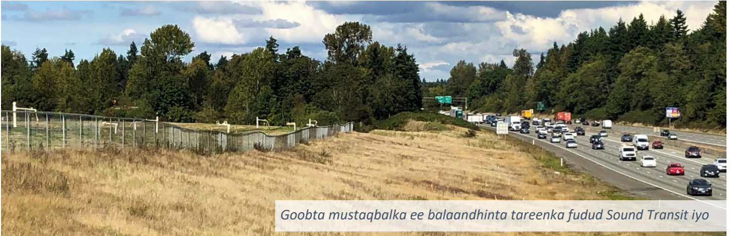
Goobta mustaqbalka ee balaandhinta tareenka fudud Sound Transit iyo