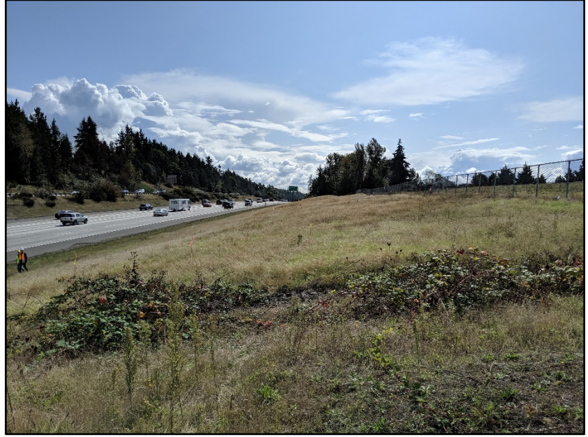
Midway Landfill iyo I-5 ee koonfurta u jeeda