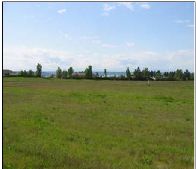
Midway Landfill duuga ku yaal