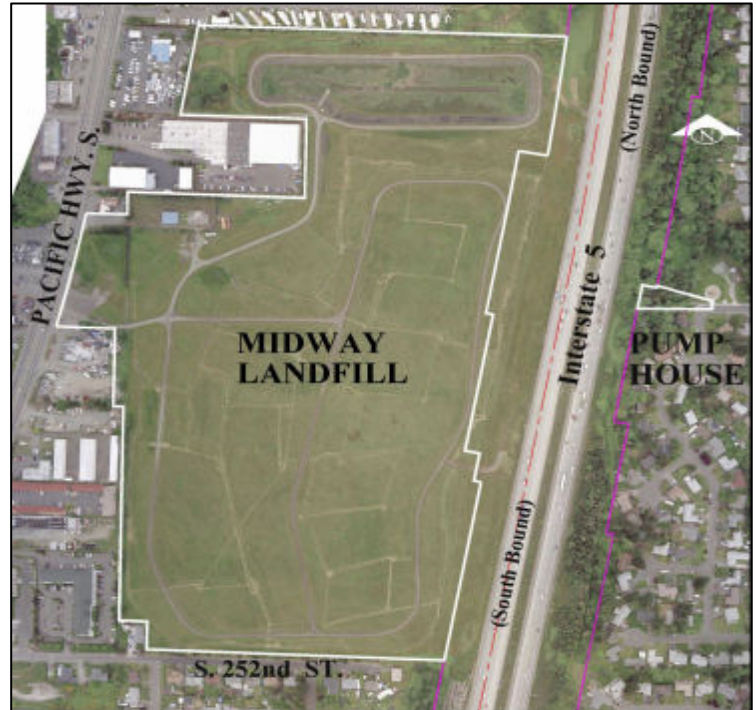
Midway Landfill waxa uu ku yaalaada goobta

City of Seattle waxay ilaalisaa qaababka oo waxay la socotaa tayada biyaha dhulka iyo gaaska dhulka la buuxiyay ee Goobta.