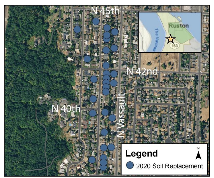
Figure 1. Twenty-nine yards receiving soil replacement in 2020.

Facility Site ID: 89267963 Site Cleanup ID: 3657