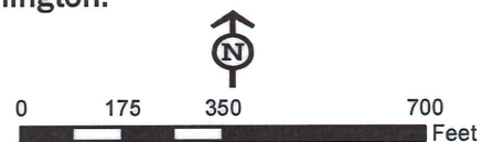
Figure 2. Site Map of 13.4-Acre Undeveloped Parcel, Pierce County, Washington.

Notes: The plotted locations of private water supply wells are not consistent with the listed addresses (see the Hydrology section of the Site Closure Report for more information).