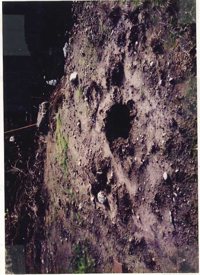
View of key sample location.

Vanrich Casting (Varicast) Removal of Site from SIS List Site Reconnaissance Richard Heggen 11/20/95 Camera: Olympus Infinity Twin 35mm