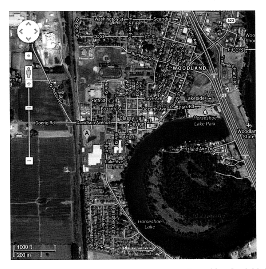
Fig 1. Location of the Unocal Bulk Plant 0855 Site, in Woodland, WA