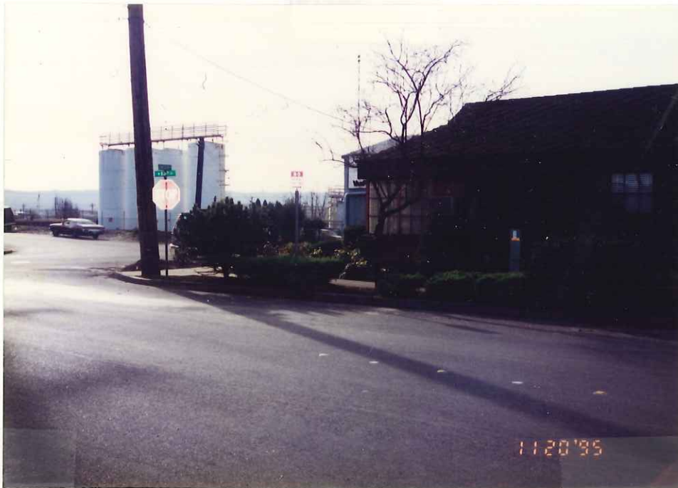
View to the southwest of the Vaircast office.

Vanrich Casting (Varicast) Removal of Site from SIS List Site Reconnaissance Richard Heggen 11/20/95 Camera: Olympus Infinity Twin 35mm