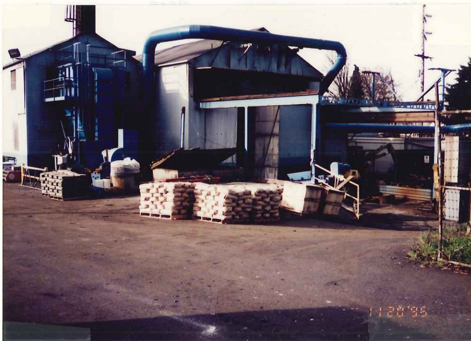
Another view to the varicast facility.