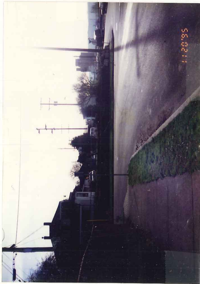
View the south of nearby residences.

Varrich Casting (Varicast) Removal of Site from SIS List Site Reconnaissance Richard Heggen 11/20/95 Camera: Olympus Infinity Twin 35mm