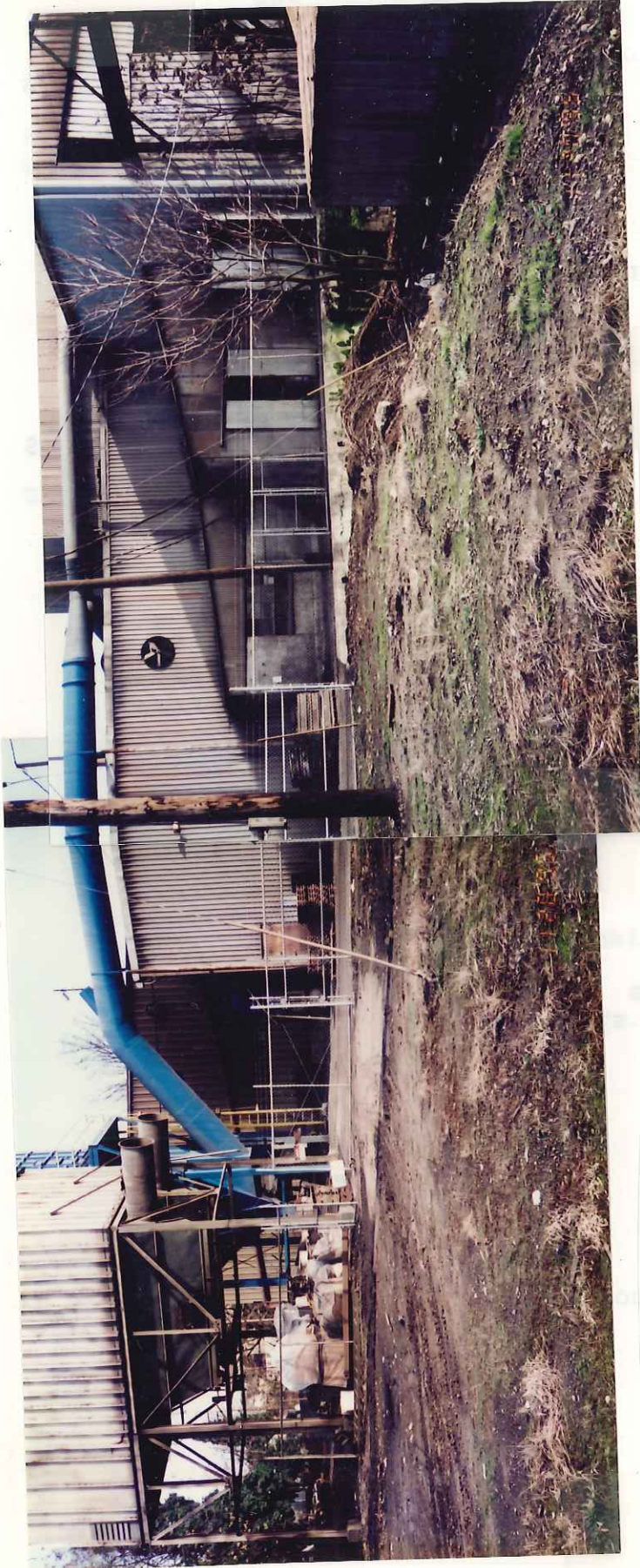
View to the east of the BN Railroad lot and & area of investigation.