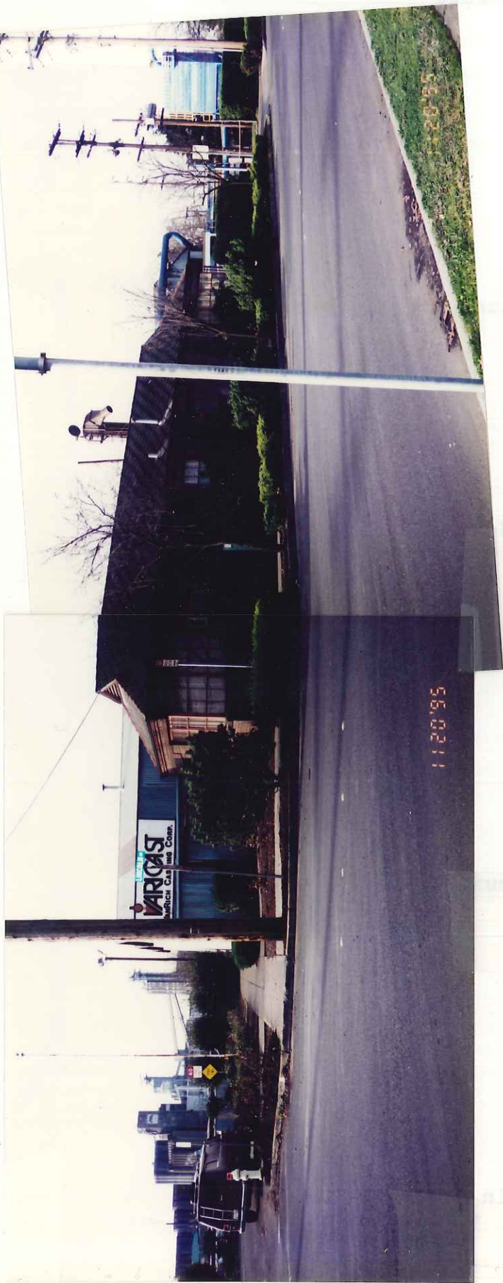
View to the west of the Varicast office and facility.