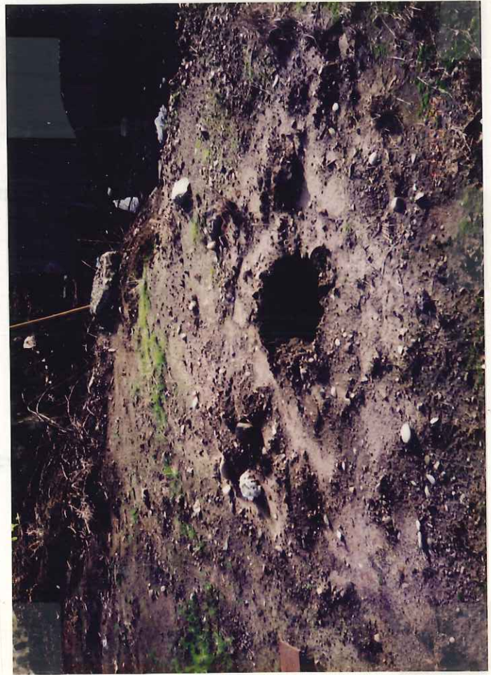
View of key sample location.

Vanrich Casting (Varicast) Removal of Site from SIS List Site Reconnaissance Richard Heggen 11/20/95 Camera: Olympus Infinity Twin 35mm