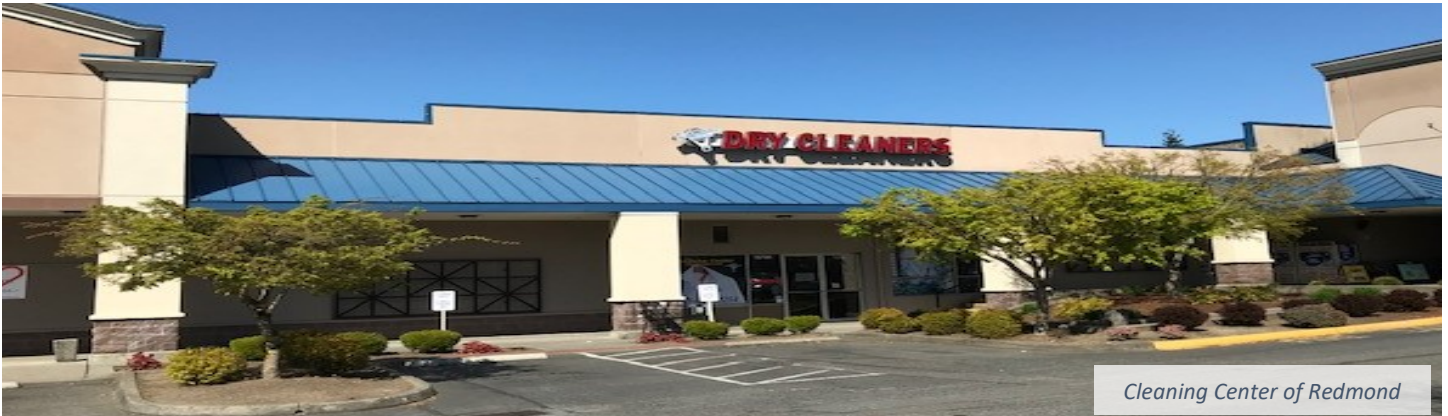
Cleaning Center of Redmond