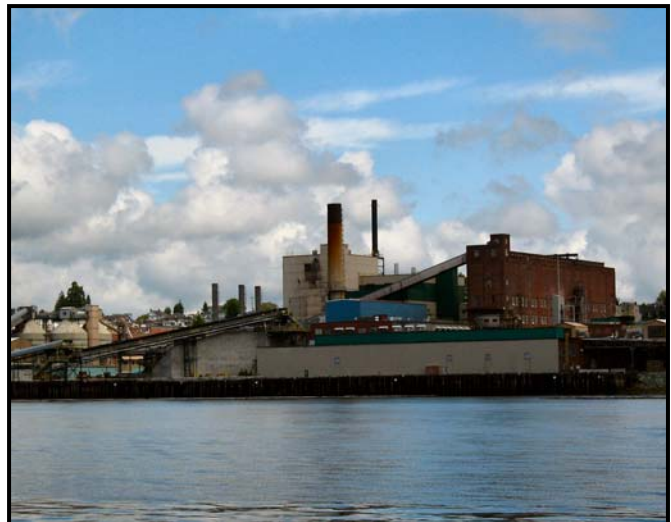
2012 photo of the Kimberly-Clark Worldwide Site looking northeast from East Waterway.