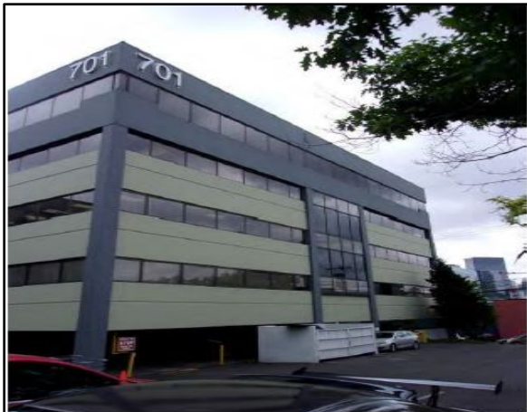
View of the 701 Dexter Cleanup Location