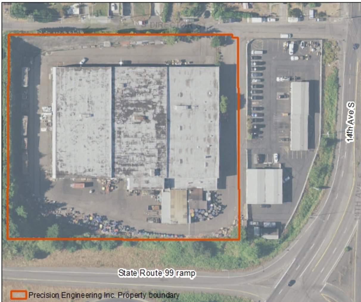
Aerial view of Precision Engineering Inc. Site.

Precision Engineering operated a heavy machining and equipment repair services shop at this location from 1968 through 2005. Activities there included grinding and polishing, honing, hard-chrome plating, milling, welding, and other flame and arc-applied metal coatings. This work involved the use of chemicals, particularly chromic acid for plating, and trichloroethylene (TCE) as a solvent.