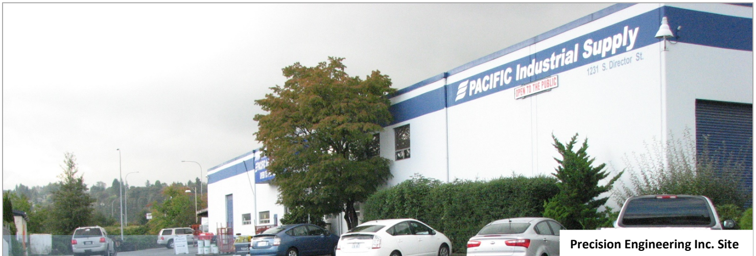
Precision Engineering Inc. Site