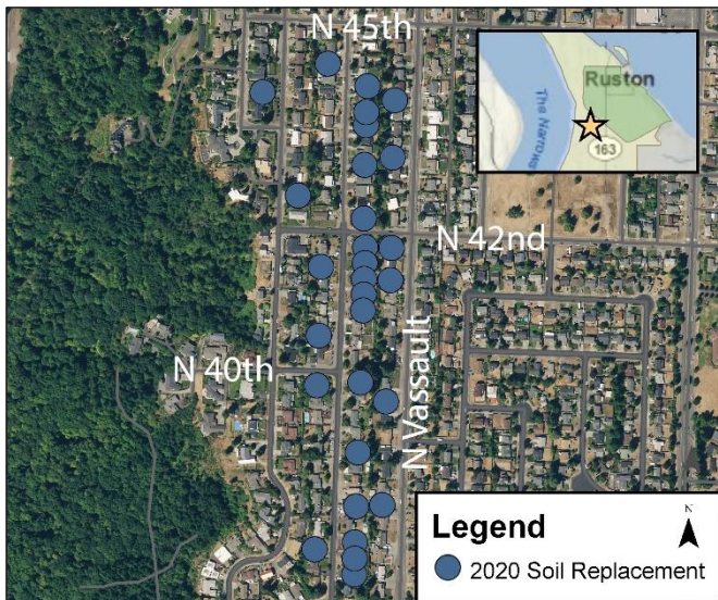
Figure 1: Planned 2020 construction. The blue dots represent twenty-nine yards receiving soil replacement in your neighborhood.

Call the Tacoma Smelter Plume Project line: (360) 407-7688, press 2