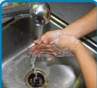
WASH YOUR HANDS with soap and water