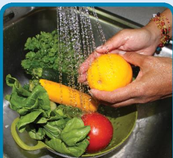
WASH ALL FRUITS AND VEGETABLES before eating