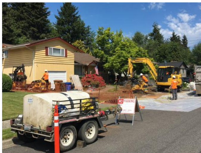
Contractors remove soil at a yard in North Tacoma.