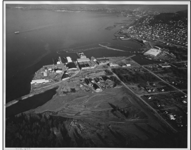
Harris Avenue Shipyard facing north, January 1967 1

The Site is one of 12 sites coordinated through the Bellingham Bay Demonstration Pilot. The Pilot is a bay-wide multi-agency effort to clean up contaminated sediment, control sources of sediment contamination, and restore habitat, with consideration for land and water uses.