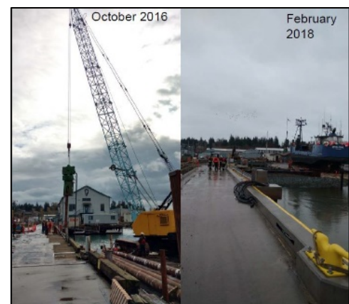
Harris Avenue Pier before/after Interim Action