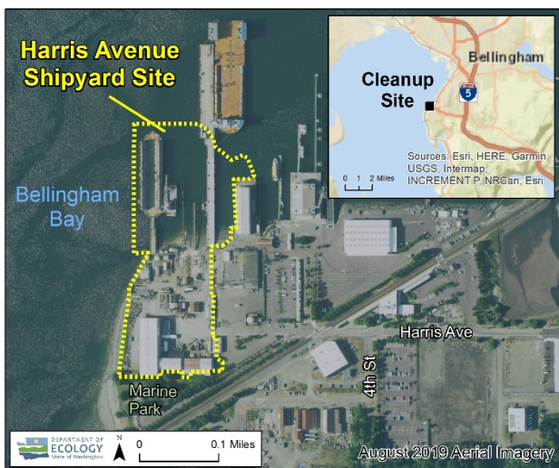
Aerial view of Harris Avenue Shipyard cleanup site