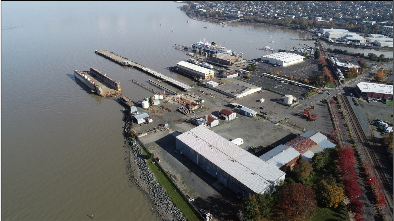
Harris Avenue Shipyard Site on Bellingham waterfront in Fairhaven neighborhood, October 2019