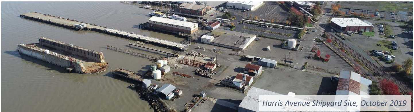
Harris Avenue Shipyard Site, October 2019