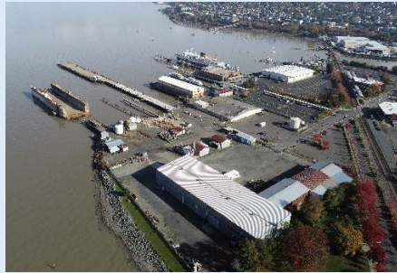
Harris Avenue Shipyard Site, October 2019