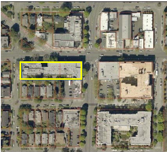
Sawirka hawada ee Stone Way Apartments.

Tarjumaadda waxaa lagu bixiyay Isbaanish, Tigrinya, Oromo, Kantonese, iyo Amxaar.