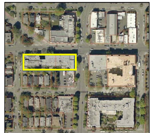
Sawirka hawada ee Stone Way Apartments.