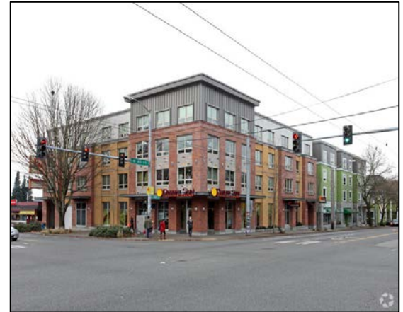
Stone Way Apartments

Saldhig adeeg ayaa ka howlgala Hantida ugu yaraan 1935. Shirkadda Shidaalka ee Standard (Heerka) (ka horreeyay Chevron U.S.A.) Inc.) iibsaday Hantida 1954 oo ay ka shaqeysay saldhigga adeegga shidaalka ee Hantida illaa laga saaray dhismaha xarunta adeegga iyo garaashka sanadkii 1969. Standard wuxuu ka iibiyey Hantida 1978 Seattle Housing Authority (SHA). SHA ayaa markaa ka iibisay Hantida Housing Resources Group (HRG) 2005, oo isla markiiba u wareejisay lahaanshaha Hantida Stone Way. Hantida ayaa tan iyo markaa loo sameeyay afar dabaq, dhisme tafaariiqle ah ama la dagi karo oo isku dhafan oo leh garaash dhulka hoostiisa.