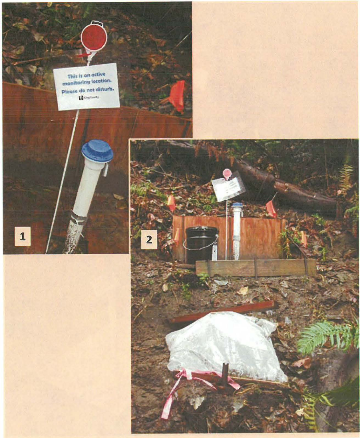
(1 & 2) Well MW-32; DOE Well tag # APJ-048. Pictures show augering platforms, wastewater discharge bucket, and auger sediment cuttings in plastic wrapping. Well is locked with locking caps and locks.