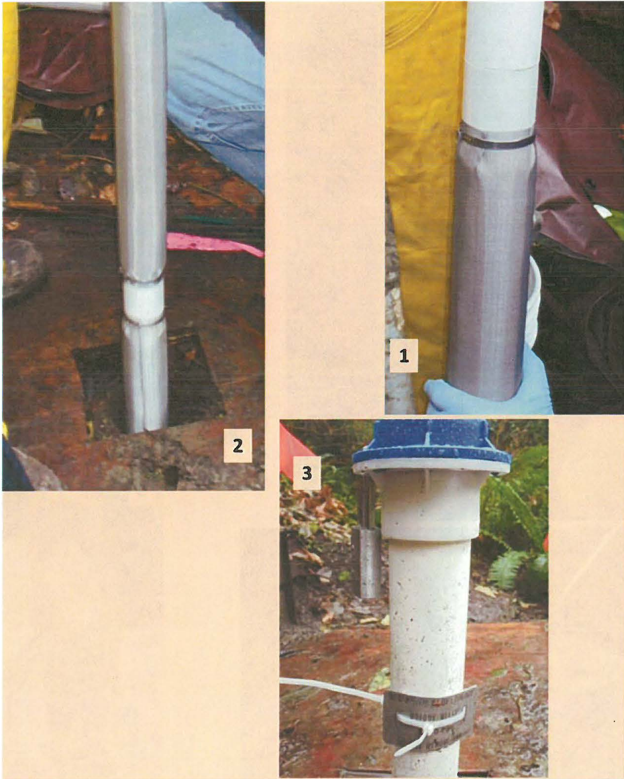
(1) Pre-packed screen around 0.010-inch slots on 2-inch PVC tubing (2) Placing two five-foot pre-packed screens (and 0.010-slots) into borehole (3) Well locking cap, lock and state well tag.