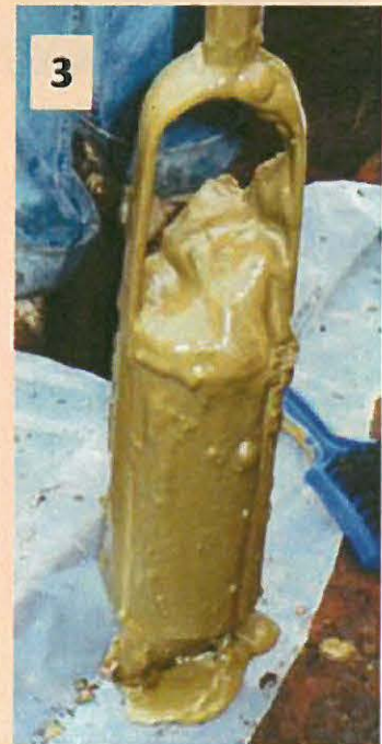
(1) Hand augering through platform access hole (2) Removing coring sediments (3) Saturated sediments in auger bit (4) Driller using soil sampler