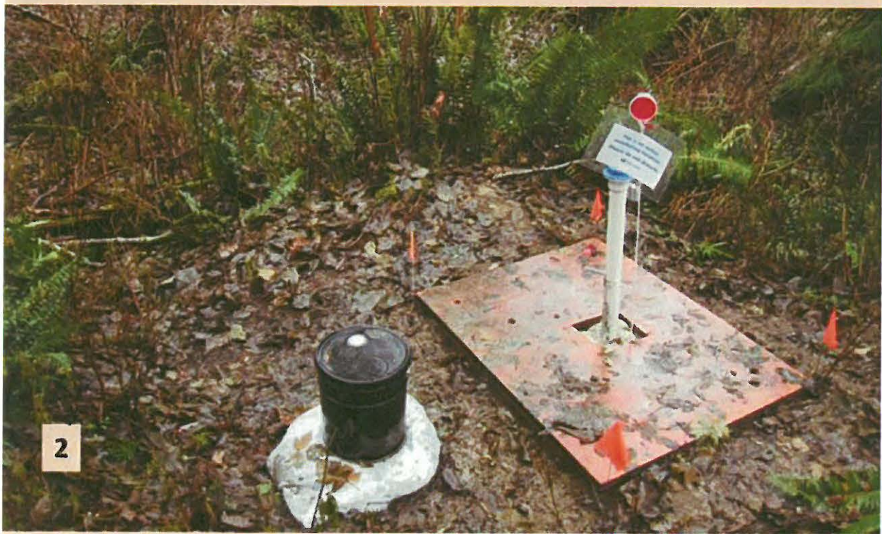
(1) Well MW-30 ; DOE Well tag # APJ-049 (2) Well MW-31; DOE Well tag # APJ-050. Both pictures show augering platforms, wastewater discharge bucket, and auger sediment cuttings in plastic wrapping. Wells are locked with locking caps and locks.