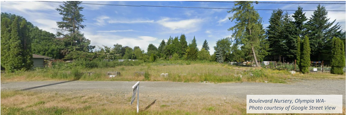
Boulevard Nursery, Olympia WA