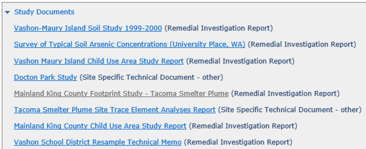
Figure 3: Screenshot of study documents or publications list.