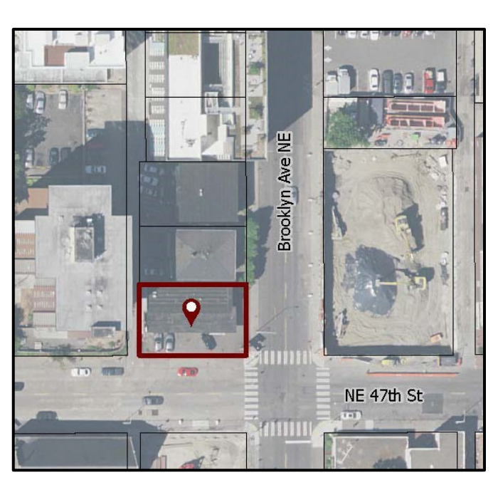
Location of Carson Cleaners site.