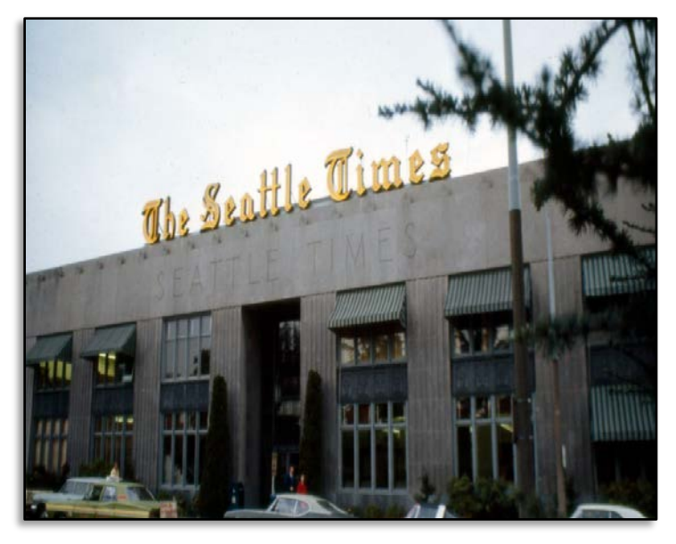
Historical View of Seattle Times Building

Seattle Times ceased operations at its 1120 John Street facility in 2011. In 2013, Onni John Street (Land) LLC (Onni) purchased the former Seattle Times facility from Seattle Times.