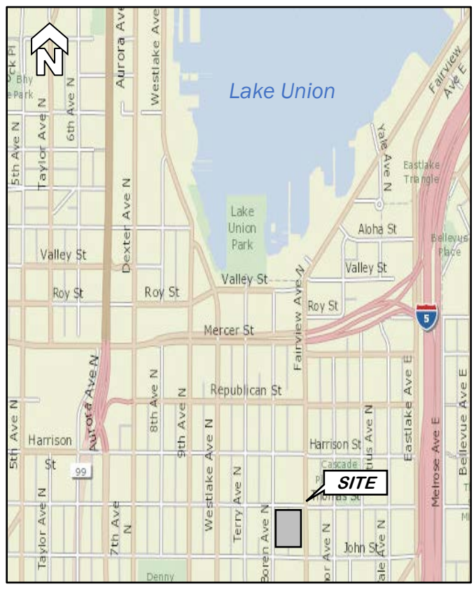
Seattle Times Site Location in Seattle