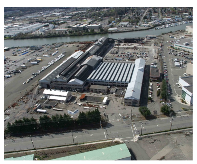
View of Jorgensen Forge Corp site, looking west