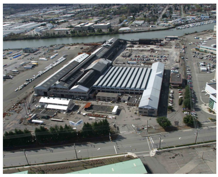
Aerial view of the Jorgensen Forge Corp site (looking west), present day.