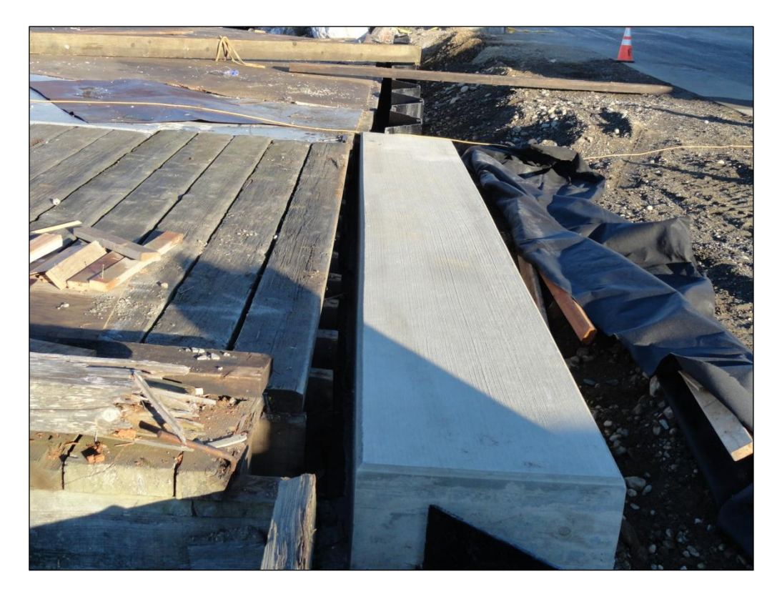
5. Completed pile cap.