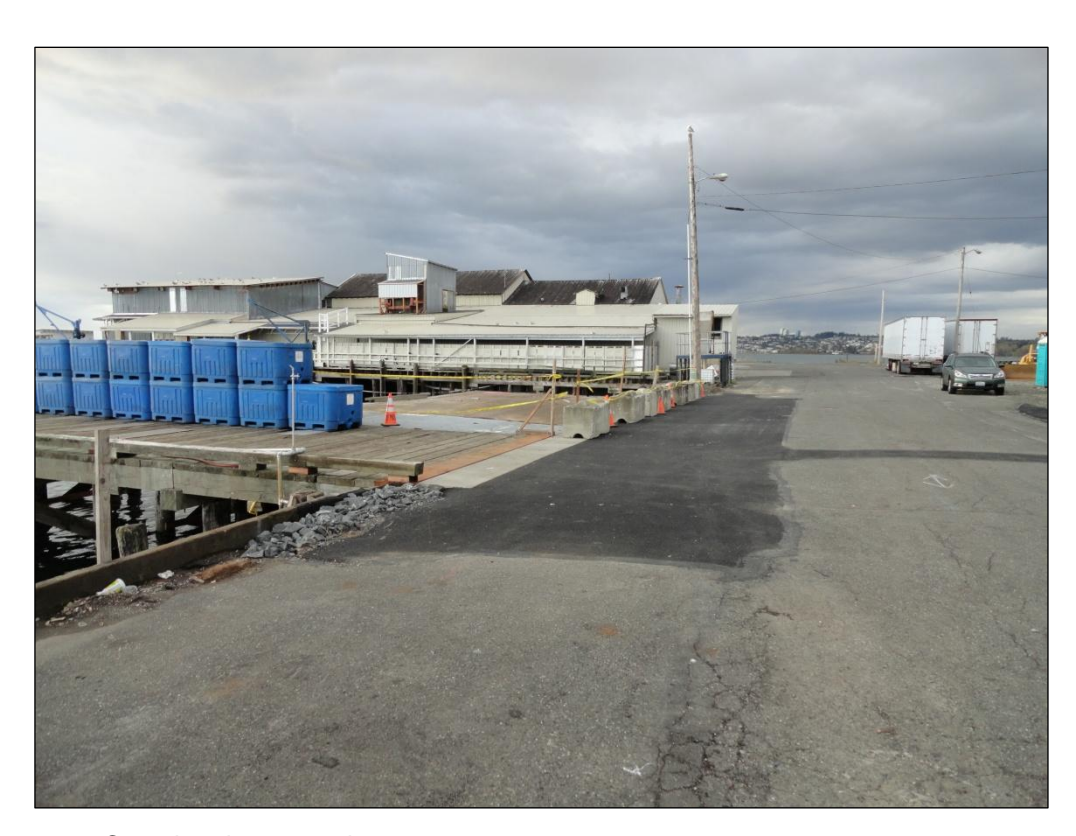
6. Completed construction.