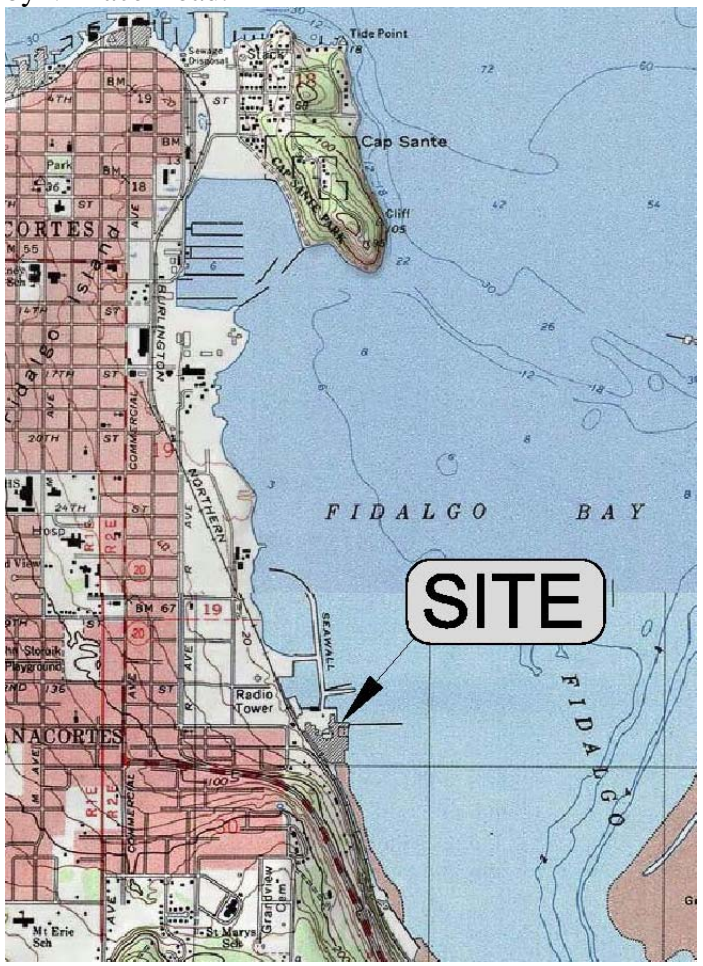
Figure 1: The Custom Plywood Mill Site is shown in the above map, located at 35<sup>th</sup> Street and V Avenue, in Anacortes, WA.

The Custom Plywood Mill Site is located at 35<sup>th</sup> Street and V Avenue in Anacortes, Skagit County, Washington (see Figure 1). The northern portion of the Site is currently used for temporary boat storage, and the southern portion of the site is vacant, with several freshwater wetlands in the upland area and one estuarine wetland. The Site is bounded on the east by Fidalgo Bay, on the west and southwest by the Tommy Thompson hiking trail, on the north and south by undeveloped land, and on the northwest by V Place Road.