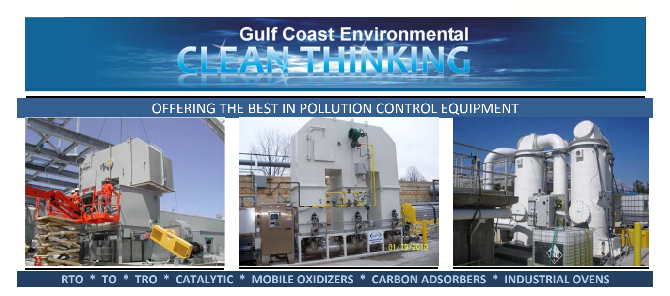
Gulf Coast Environmental offers durable equipment for a wide range of applications. Thank You for Considering Gulf Coast Environmental.