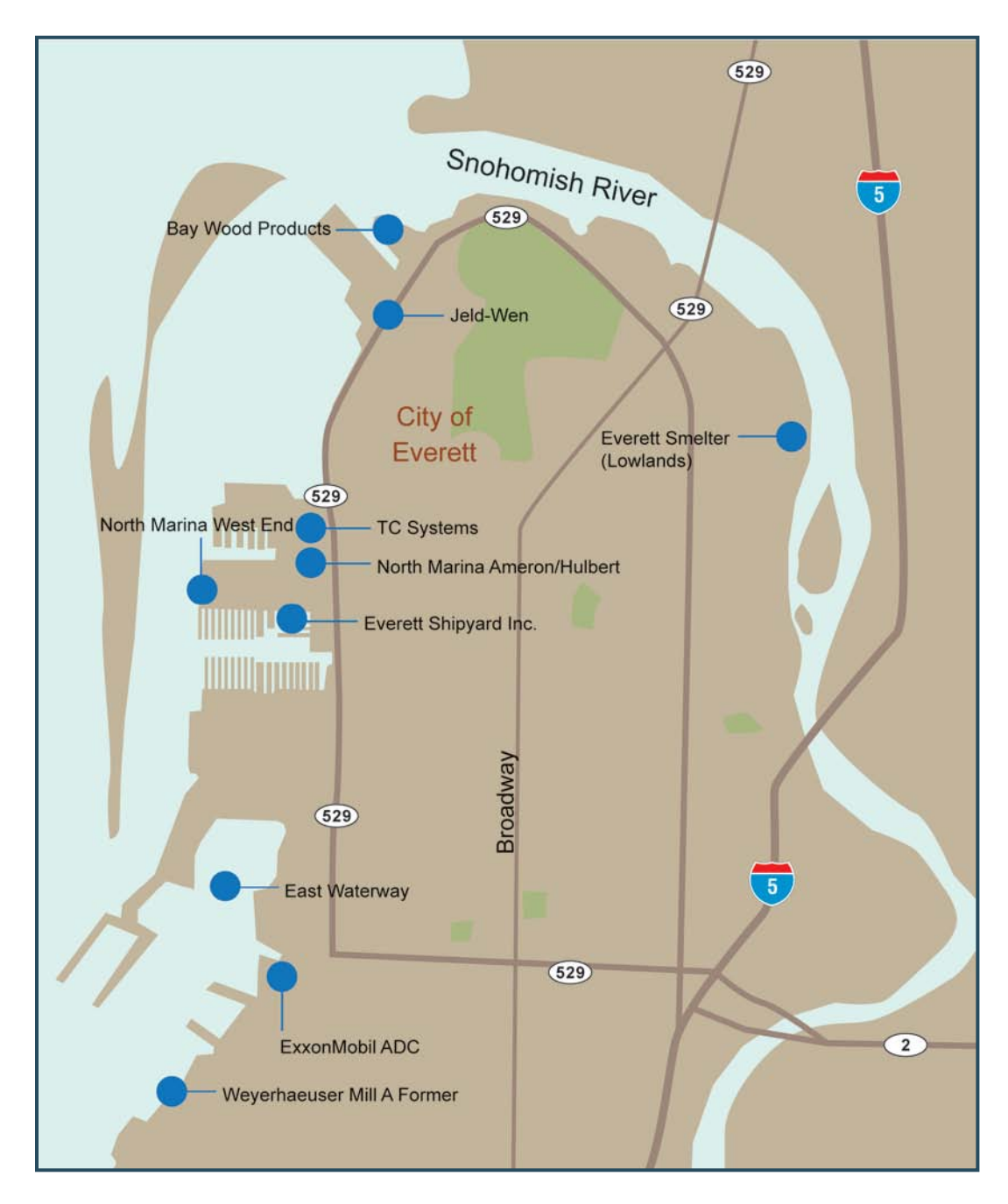
Figure 1. Everett baywide area cleanup sites under the Puget Sound Initiative.