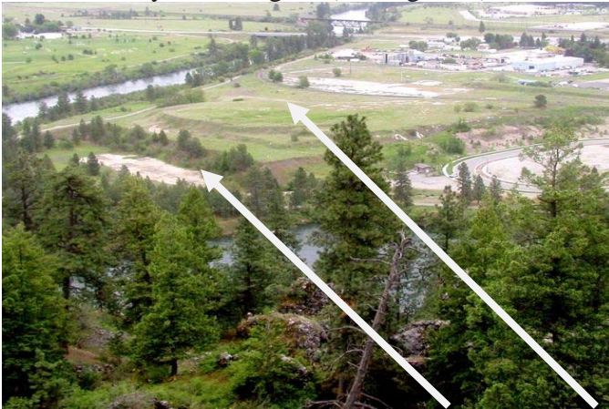
Looking in a southeast direction toward the site

The site is located at 12207 East Empire Avenue in the city of Spokane Valley, Spokane County, Washington (see Figure 1).