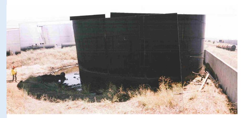
Figure 2. The BNSF Railway Black Tank around 1999. The tank stored petroleum products until 2006 when it was emptied and removed.

Ecology did not have staff resources available to require BNSF and Marathon to start the cleanup until 2012.