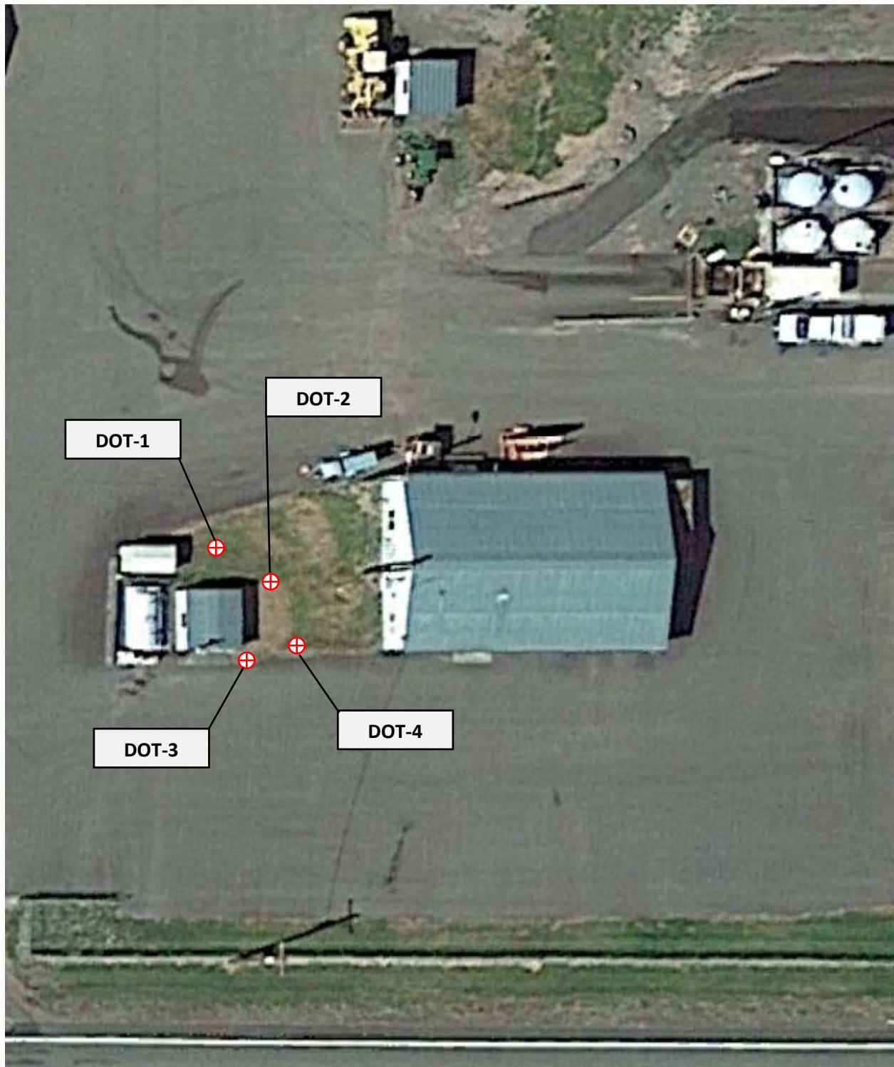
Figure 5b. Proposed Soil Boring Locations. Washington State Department of Transportation, Toledo Maintenance Facility, State Route 505, Milepost 1.43, Toledo, Washington.