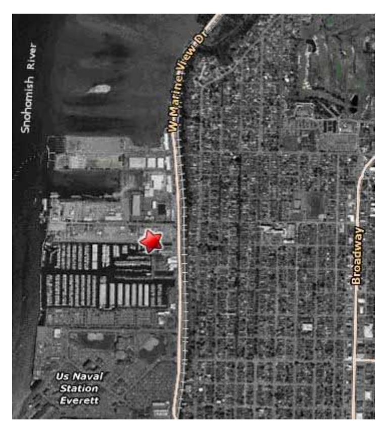
Figure 1 : The Everett Shipyard Site is shown in the above map, generally located at 1016 14<sup>th</sup> Street in Everett, Snohomish County, WA.

This Site is located along Everett's waterfront and includes approximately five acres of upland area, west of West Marine View Drive, and adjacent in-water areas. The Site is rectangular in shape. It is bounded by 14th Street to the north, Port of Everett Marina to the south, Burlington Northern Railroad and West Marine View Drive to the east, and Port Gardner Bay to the west. The site is located in the vicinity of the South and Central Docks of the Port's Marina, south of where the Snohomish River flows into Port Gardner Bay.