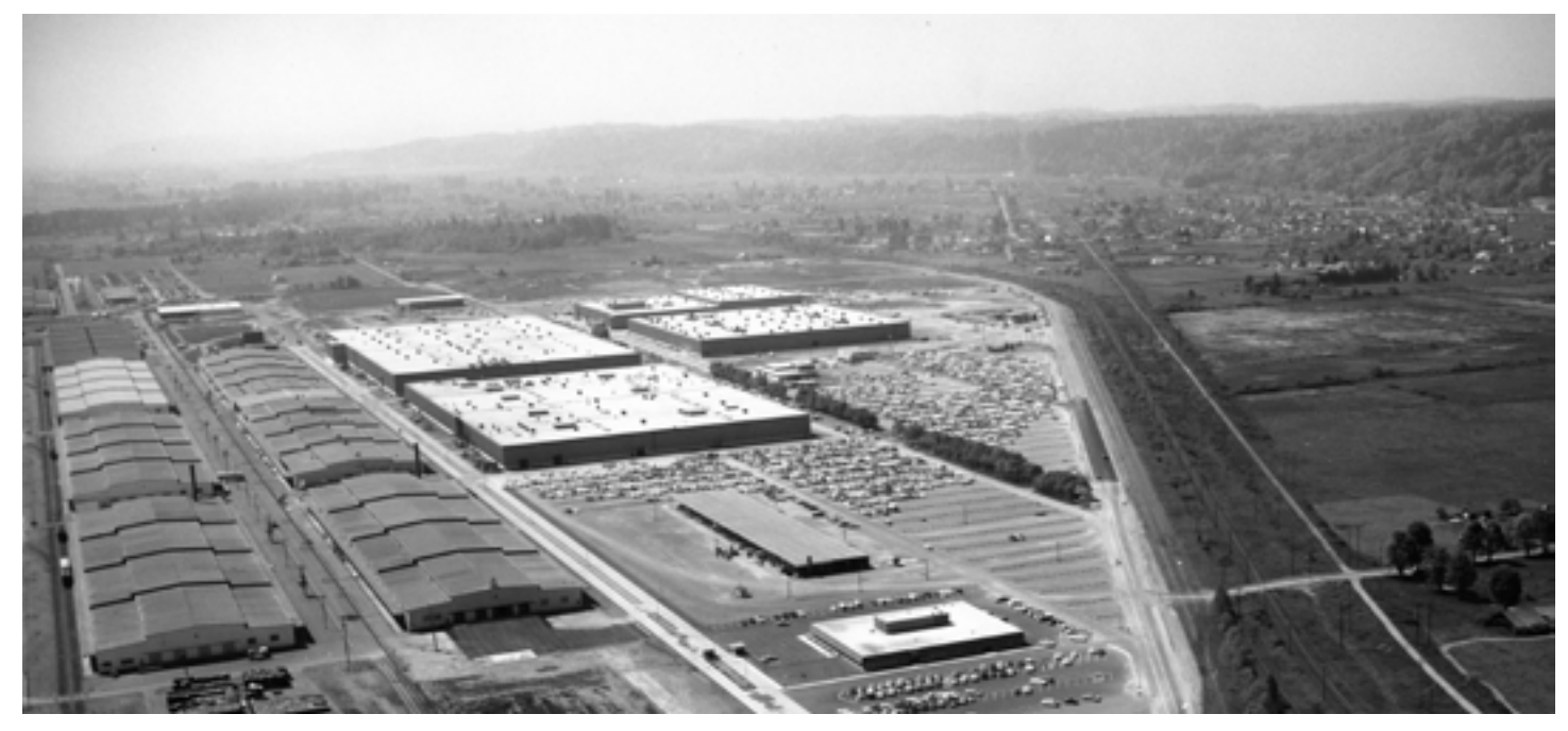
Historic photo of Boeing Auburn Facility