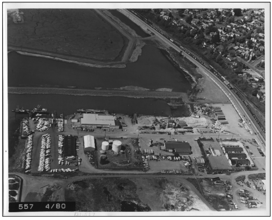
I & J Waterway facing northwest, April 1980

The study found polycyclic aromatic hydrocarbons (PAHs), phthalates, phenols, and nickel in marine sediment. These contaminants are likely related to historic activities, including: lumber mill operations, rock crushing, food/seafood processing, and stormwater inputs. A