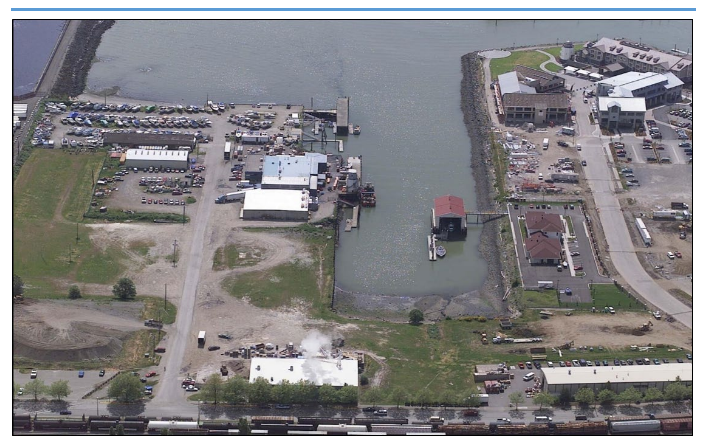
I & J Waterway looking southwest, May 2001