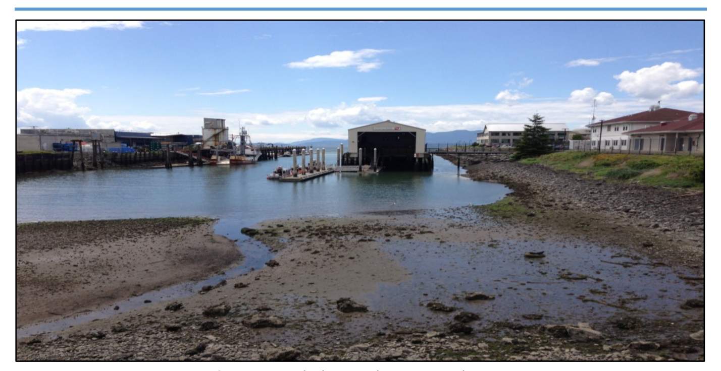
I & J Waterway looking southwest, November 2014