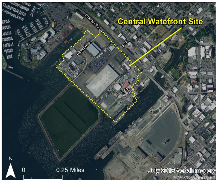
Aerial view of Central Waterfront cleanup site