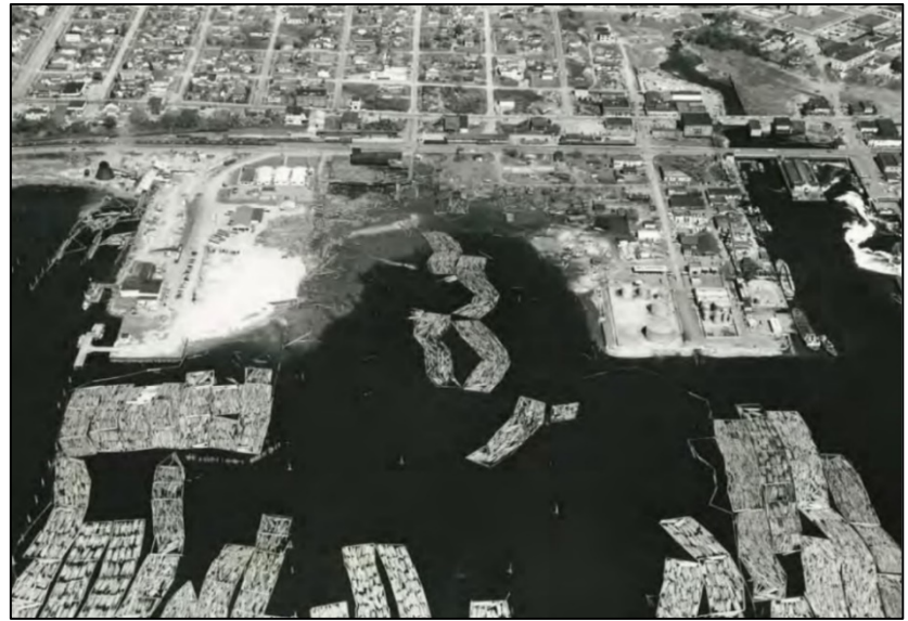
Central Waterfront site facing northeast, 1955

The Central Waterfront cleanup site is made up of about 51 acres on Bellingham’s downtown waterfront, between I & J Waterway and Whatcom Waterway, and between Roeder Avenue and the former Georgia-Pacific industrial wastewater treatment lagoon. Property within the site is owned by the Port of Bellingham, Sanitary Service Company, and Puget Sound Energy. Beginning in the early 1900s, property within the site was created by filling tidelands for various industrial uses.