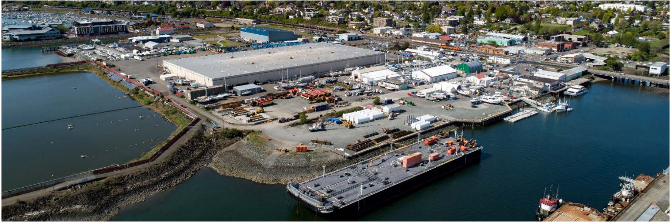
Central Waterfront and Whatcom Waterway sites facing north, May 2019