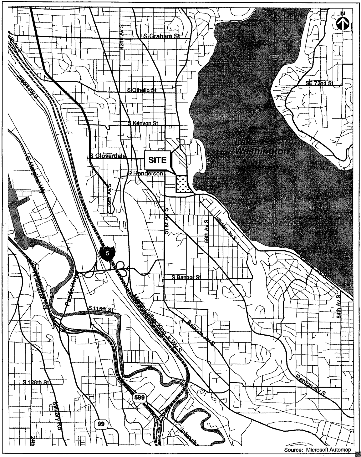
Figure 1. Seward Park Estates vicinity map, Seattle, Washington.