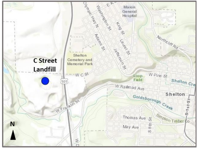
Figure 1. The landfill is southwest of the intersection of West C Street and US Highway 101.