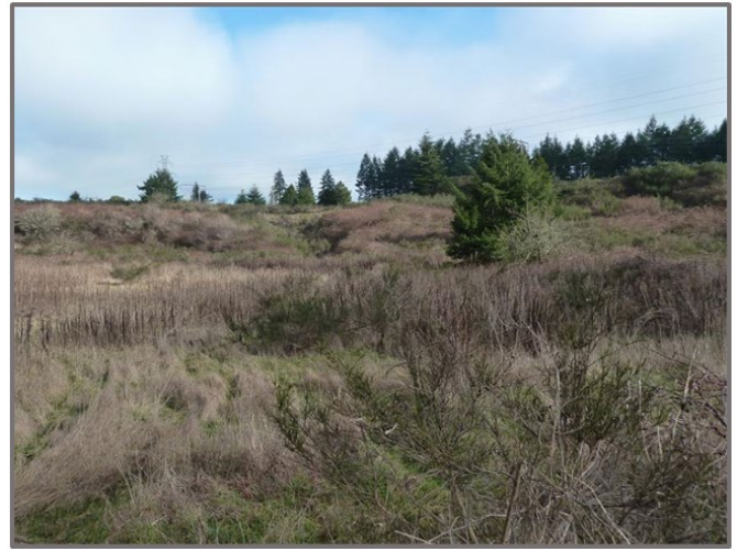
Figure 2. The property is vacant, undeveloped land covered by shrubs and trees.

The Site is a 16.7-acre property. Before 1928, the property was mined for sand and gravel. In 1928, the city purchased the property and began using it as a landfill until the mid-1980s. The waste is located in an area of about four acres on the property.